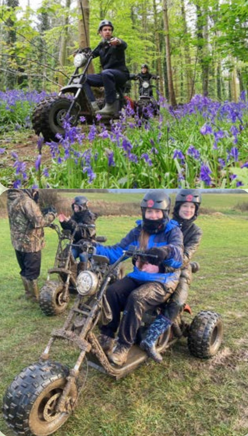
How to book: -Pre bookings